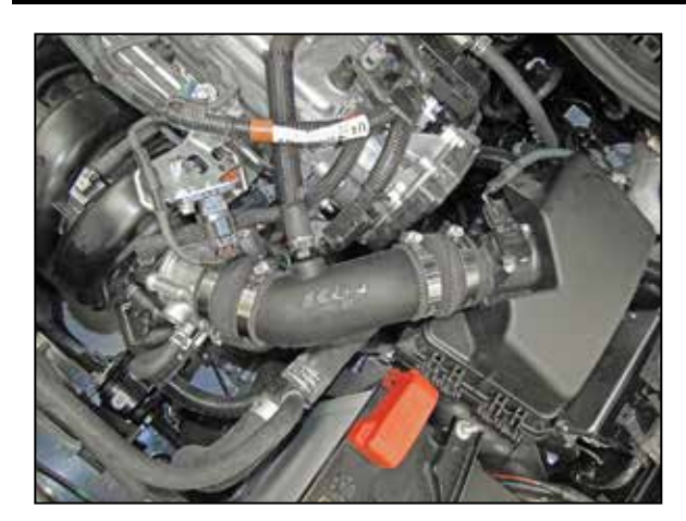
7. Install the K&N® intake tube into the coupler at the throttle body and then into the coupler on the air filter housing, adjust the tube for best fit and then secure with the provided hose clamps. Install the crank case vent hose onto the fitting and secure with the factory spring clamp.