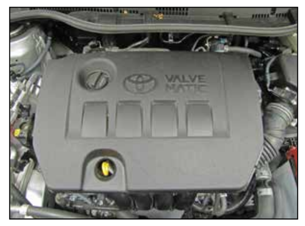
2. Lift up and remove the decorative engine cover.

NOTE: Disconnecting the negative battery cable erases pre-programmed electronic memories. Write down all memory settings before disconnecting the negative battery cable. Some radios will require an anti-theft code to be entered after the battery is reconnected. The anti-theft code is typically supplied with your owner's manual. In the event your vehicles anti-theft code cannot be recovered, contact an authorized dealership to obtain your vehicles anti-theft code.