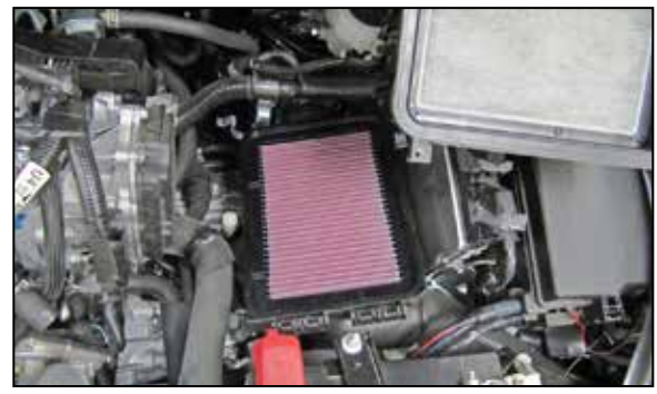
4. Release the clips that secure the upper air filter housing, lift up the housing and remove the factory air filter. Install the provided K&N® air filter and then reinstall the upper housing and secure with the factory retaining clips.

NOTE: K&N Engineering, Inc., recommends that customers do not discard factory air intake.