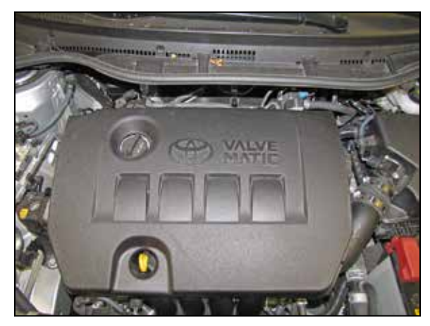
8. Reinstall the decorative engine cover